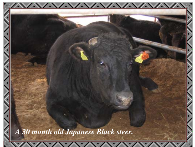
A 30 month old Japanese Black steer.

Cattle) for approximately $5,000 per head. The cattle are raised to approximately 30 months of age and 1800 pounds. Feed costs are $2,000 to $3,000 per head from 9 to 30 months of age. The Japanese Black steers are purchased for approximately $10,000 by Japanese restaurants and retailers who specialize in high quality meat.