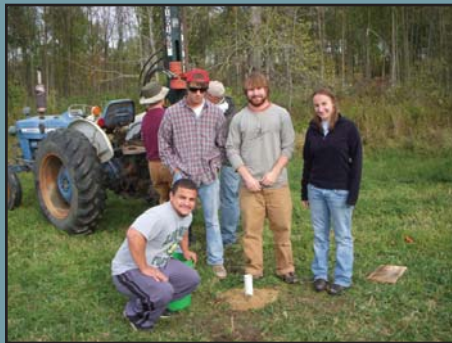
The William H. Miner Agricultural Research Institute

1034 Miner Farm Road P.O. Box 90 Chazy, NY 12921 Phone: 518-846-7121 Fax: 518-846-8445