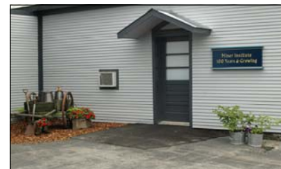
The new Miner Institute 100 Years and Growing Theater.

Visitors will find our newest video, "Miner Institute: 100 Years and Growing" in a new theater of the same name. The DVD highlights changes in North Country agriculture during the last century and the prominent role that Miner Institute continues to play in this industry.