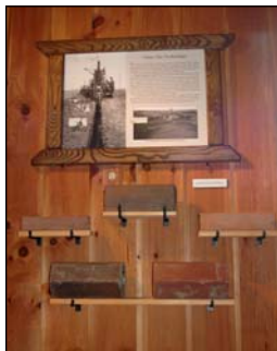
Exhibit depicting Mr. Miner's extensive use of drain tiles.

The exhibit, located in the farm's original storehouse, features numerous historic photographs; a diorama of the farm; informative panels describing innovations such as hydroelectric power production and the use of drain tiles. Several videos that portray life and work on the farm and include early footage and photographs from that time.