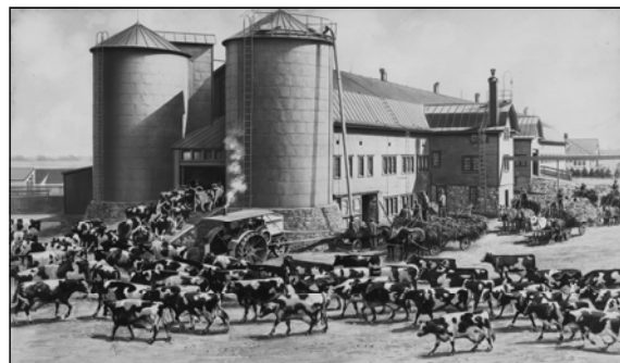
Historic print from Heart's Delight Farm.