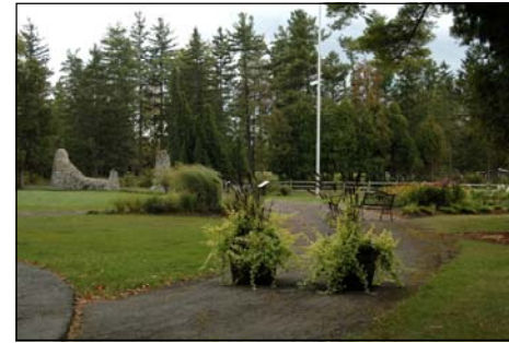
Wayside Walk and Heart's Delight Farm's original stone entrance.