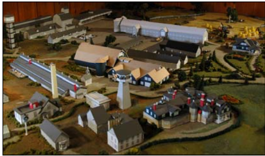
Diorama of Heart's Delight Farm