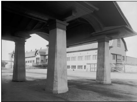
The Heritage Exhibit is housed in the building that was once used as the farm's storehouse. It was built in 1905.

Heart's Delight Farm Heritage Exhibit Miner Institute 1034 Miner Farm Road PO Box 90 Chazy, NY 12921