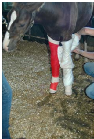
FAR RIGHT: Odin in late September. He has made progress, but still needs leg wraps.